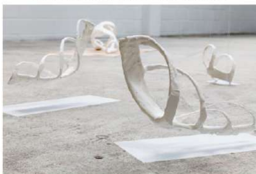
Artocène 2023, Aïtch Randini, Les métamorphoses, 2017