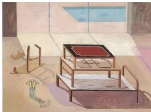
Artcine 2023, Soïane Ortolé, Médium vacante