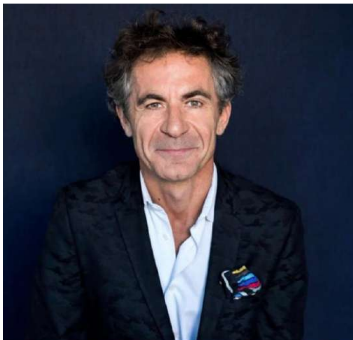
Artocène 2023 – Étienne Klein

The 2023 Artocene festival has the honour of having the noted physicist and philosopher Étienne Klein as its scientific advisor. Klein, the director of research at the CEA and a professor at the Ecole Centrale de Paris, offers profound insights into the concept of the Void. His words powerfully encapsulate the festival's spirit: "Emptiness. It is commonly said, is what remains after everything has been removed. But if absolutely everything were removed, there would be nothing left... at all."