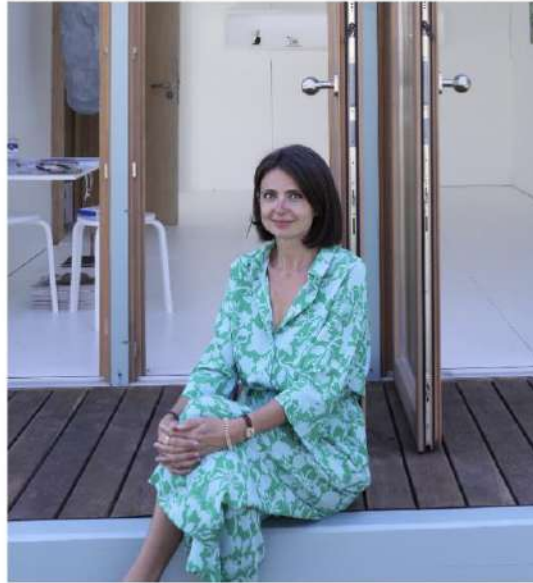
Artcine 2021, Lesvins Maréchal